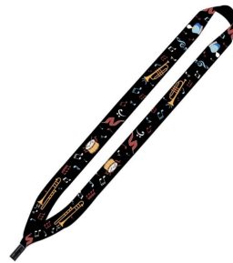
Sandia Band lanyard