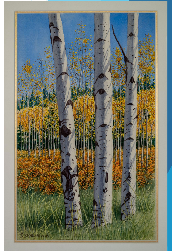
Dan Stouffer Teton Aspen