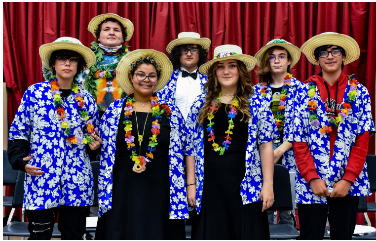
Steel Drum Band